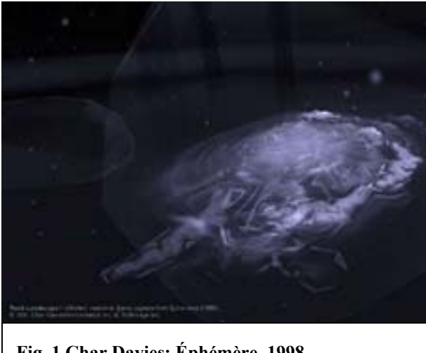
Fig. 1 Char Davies: Éphémère, 1998.

Today, media artists are shaping highly disparate areas, like telepresence art, biocybernetic art, robotics, Net Art, and space art; experimenting with nanotechnology, artificial or A-life art; creating virtual agents and avatars, datamining, mixed realities, and database-supported art. These specialist areas can be roughly assigned to the fields of telematic, genetic, or immersive–interactive art; subsumed under the generic term virtual art .<sup>3</sup>