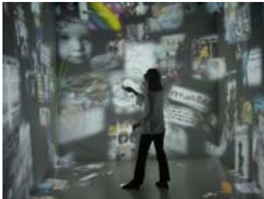
Fig. 5 Christa Sommerer / Laurent Mignonneau: The Living Web , 2002.

competence, which goes beyond mere technical skills, is difficult to acquire if the area of historic media experience is excluded. Media exert a general influence on forms of perceiving space, objects, and time and they are tied inextricably to humankind's evolution of sense faculties. For how people see and what they see are not simple physiological questions; they are complex cultural processes, which are influenced by many and various social and media-technological innovations. These processes have developed specific characteristics within different cultures and it is possible to decipher these step by step in the legacy left by historical media and literature concerned with visualization, including from the fields of medicine and optics. Not least, in this way light can be shed on the genesis of new media, which are frequently encountered for the first time in works of art as utopian or visionary models.