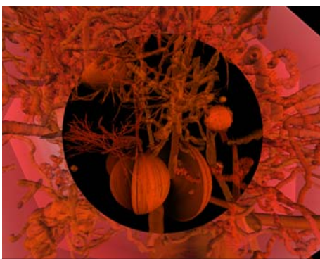
Fig. 4 Christa Sommerer & Laurent Mignonneau : Anthroposcope 1993.

For the interests of media art it is of importance that we continue to take media art history into the mainstream of art history and that we cultivate a proximity to film- cultural and media studies, computer science, but also philosophy and other sciences dealing with images.