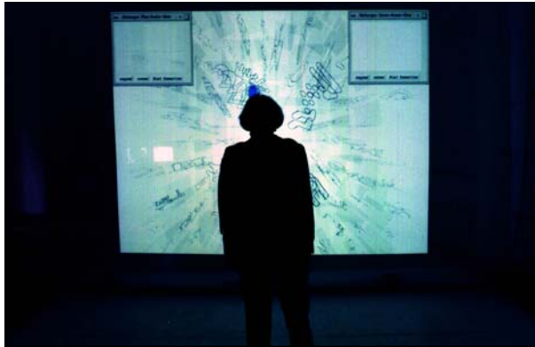
Fig. 2 Monika Fleischmann: Murmuring Fields , 1998.

Artist-scientists, such as Christa Sommerer and Berndt Lintermann, have begun to simulate processes of life (fig. 4): evolution, breeding, and selection have become methods for creating artworks. And, last but not least, with their work The Living Web Christa and Laurent generate from automated search engines for web images a spatial information sphere in a CAVE (fig. 5). The work not only permits elegant, multi-layered interaction, it is also a new scientific instrument for visual analysis, with the option of comparing up to 1000 images in a scientific discussion. 6